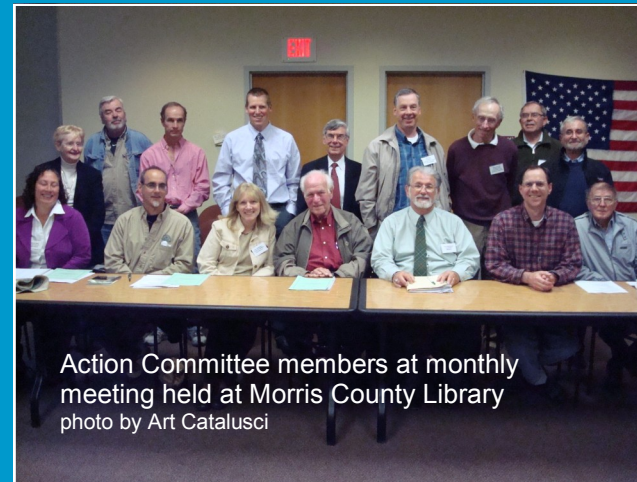
Action Committee members at monthly meeting held at Morris County Library