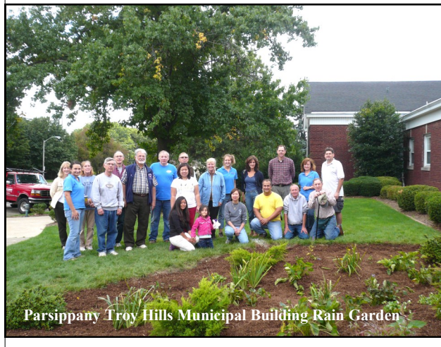
Parsippany Troy Hills Municipal Building Rain Garden

The Whippany River Clean it! Protect it! Enjoy it!