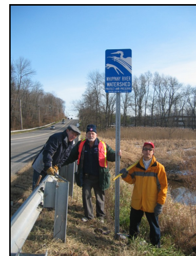
Action Committee members put up a watershed awareness sign on Columbia Turnpike in Florham Park

The Whippany River Watershed Action Committee will continue to be a vibrant organization, known for getting things accomplished with its active members and multiple ongoing projects. The Action Committee will be