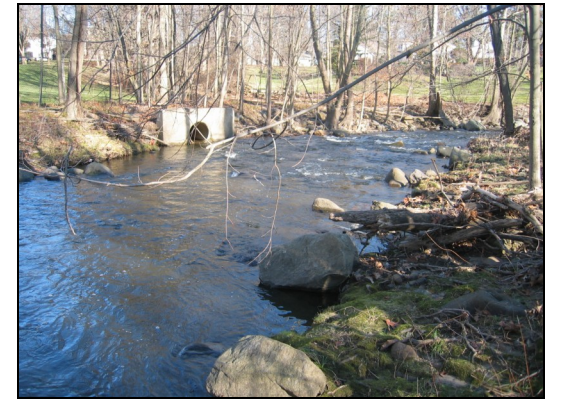
River Assessment Site "#7" for Non Point Source Grant, located on So. Beverwyck Road in Parsippany Troy Hills

Additional support has been provided by: Morris County Soil Conservation Service — Burnham Park Association — Lake Pocahantas — AmeriCorps — Scout Troops — Morristown High School — The Land Conservancy of New Jersey